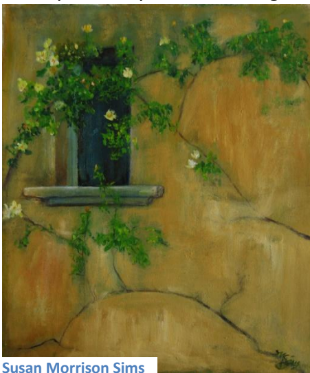
Susan Morrison Sims

Grambois is a charming hill-top village in the Eastern Luberon with 12th century ramparts, a Knights Templar gate and a noble's residence built on the ruins of an old château. You find many carefully restored village houses, cobbled streets and wisteria covered terraces.